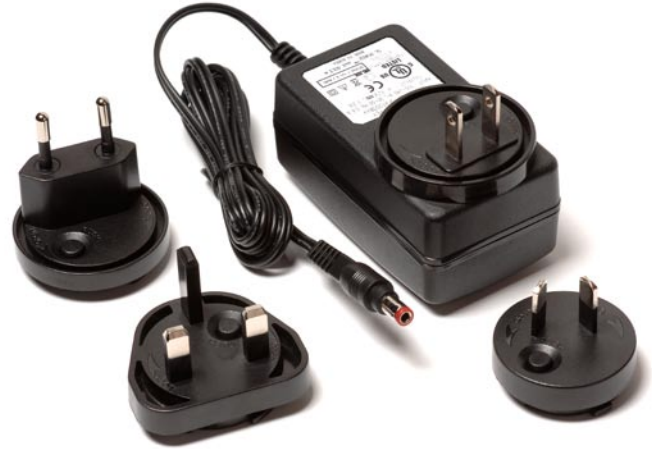
*Photo shows optional blades kit